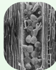
Photograph of vessel clogged by pathogens